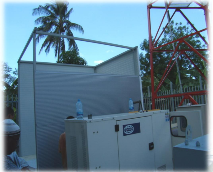
Installations of Tower generators and power room (shelters)