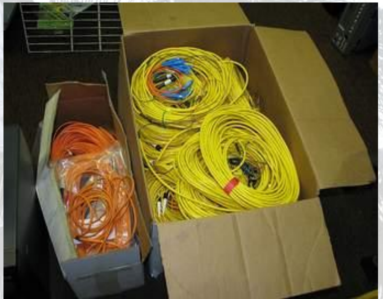
Security Systems Installation